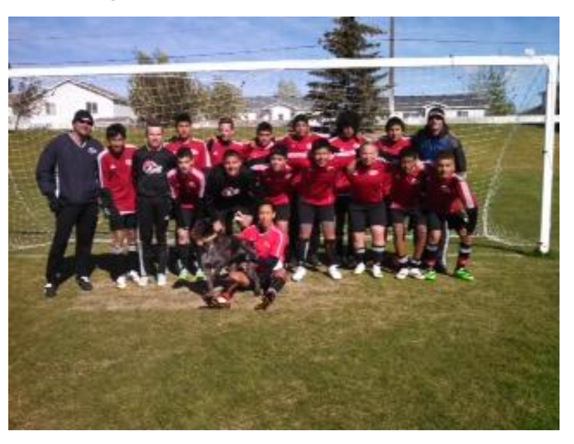
Hometown Champions 2014

Lobos U12B Xtreme U15B Odyssey U14G (Blue Division)